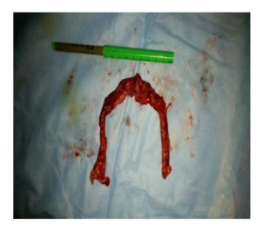
Figure 5: The segment of resected stenosed ascending, transverse and descending colon

Abdominal examination revealed uniformly distended abdomen with visible peristalsis, everted umbilicus, tympanitic percussion notes and hyperactive bowel sounds. Digital rectal examination was unremarkable. Plain abdominal radiograph showed gaseous distension of bowel loops in the entire abdomen and gas in the rectum. Barium enema revealed multiple areas of colonic stenosis [figure 3]. Serum electrolytes were within normal limits and haemoglobin estimation was 5.7g/dl. He was transfused and optimized prior to surgery.