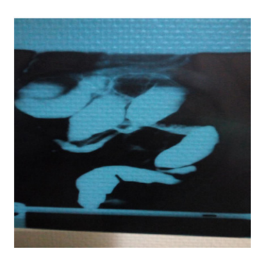
Figure 4: The segment of resected stenosed ascending transverse and descending colon