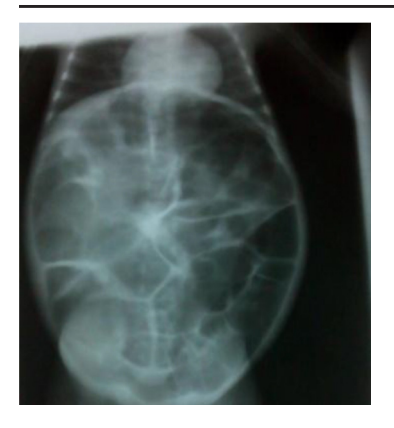
Figure 2: Intra-operative picture showing stenosed ascending colon (left arrowe), dilated caecum and distal ileum(right arrow)

Clinical examination at presentation revealed moderate pallor, weight of 3.2Kg, markedly distended and tense abdomen with visible peristalsis, tympanitic percussion notes and hyperactive bowel sounds. Digital rectal examination was unremarkable.